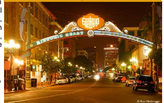
Gas Lamp District